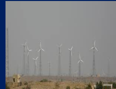
Jaisalmer Wind Park: 1,064MW Rajasthan