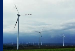
Brahmanvel Wind Farm: 528MW Maharashtra