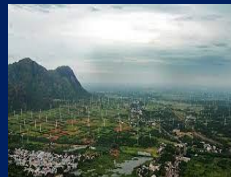
Muppandal Wind Farm: 1,500MW Tamil Nadu