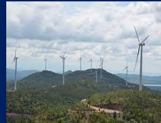
Vankusawade Wind Park: 259MW Maharashtra