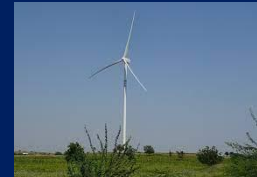
Dhalgaon Wind Farm: 278MW Maharashtra